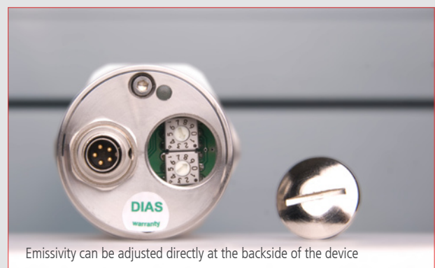
Emissivity can be adjusted directly at the backside of the device